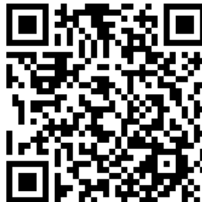
1 - 2023 Ashland County Fair DUNF form

2023 Ashland County Fair DUNF form: https://osu.az1.qualtrics.com/jfe/form/SV_bswQYyXc0OLKBOS